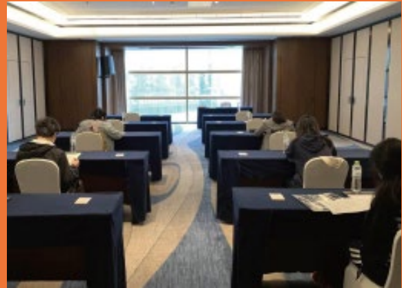
Offline competitions in test centers